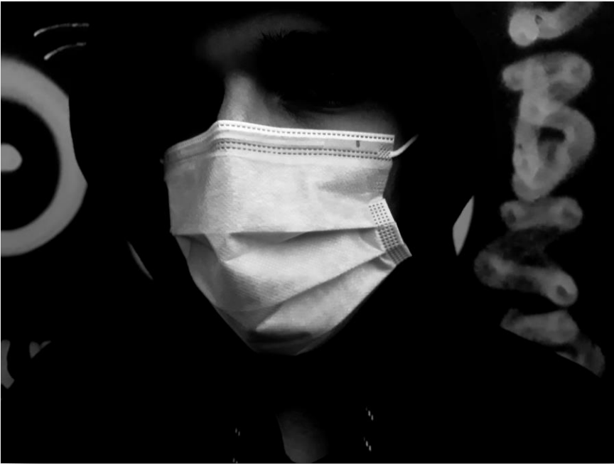
"How Covid19 excludes us"